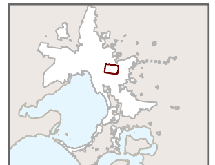
Part of Planning Scheme Map 6VPO

Disclaimer This publication may be of assistance to you but the State of Victoria and its employees do not guarantee that the publication is without flaw of any kind or is wholly appropriate for your particular purposes and therefore disclaims all liability for any error, loss or other consequence which may arise from you relying on any information in this publication.