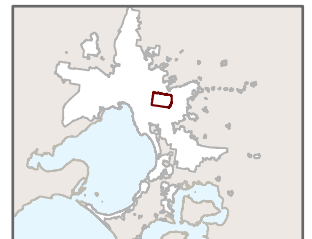
Part of Planning Scheme Map 6DDO

Disclaimer This publication may be of assistance to you but the State of Victoria and its employees do not guarantee that the publication is without flaw of any kind or is wholly appropriate for your particular purposes and therefore disclaims all liability for any error, loss or other consequence which may arise from you relying on any information in this publication.