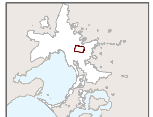
Part of Planning Scheme Map 6SLO

Disclaimer This publication may be of assistance to you but the State of Victoria and its employees do not guarantee that the publication is without flaw of any kind or is wholly appropriate for your particular purposes and therefore disclaims all liability for any error, loss or other consequence which may arise from you relying on any information in this publication.