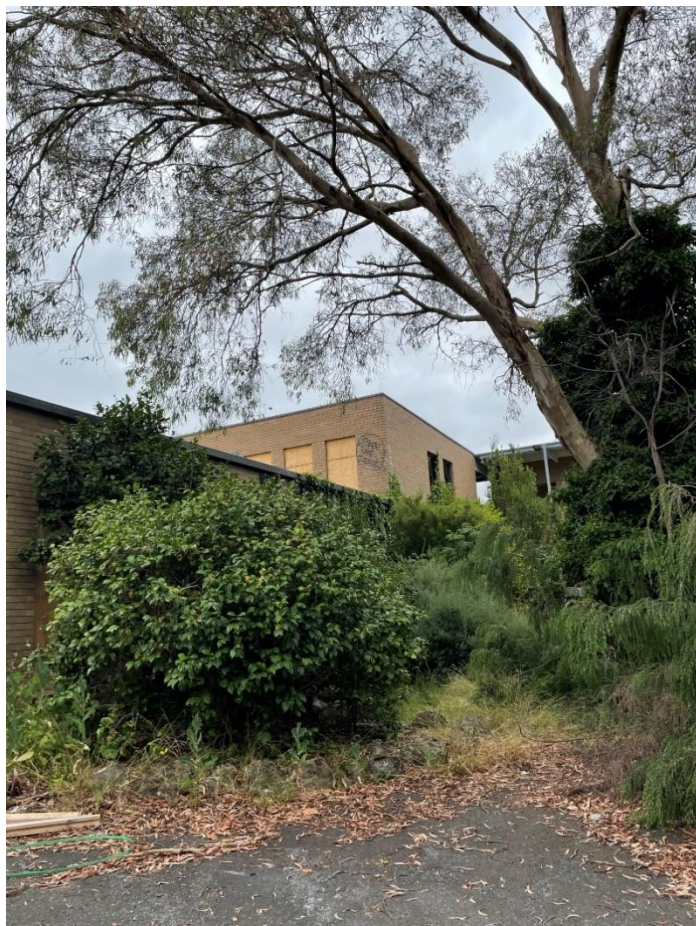
Planting between Research Wings 1 and 3 post-dates Mann's involvement, January 2023.