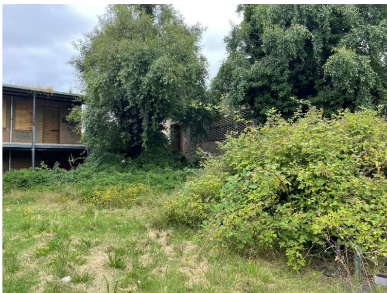
Internal courtyard to south-east of Administration Building. Weed growth disguises the simple and functional planting lay out, January 2023.