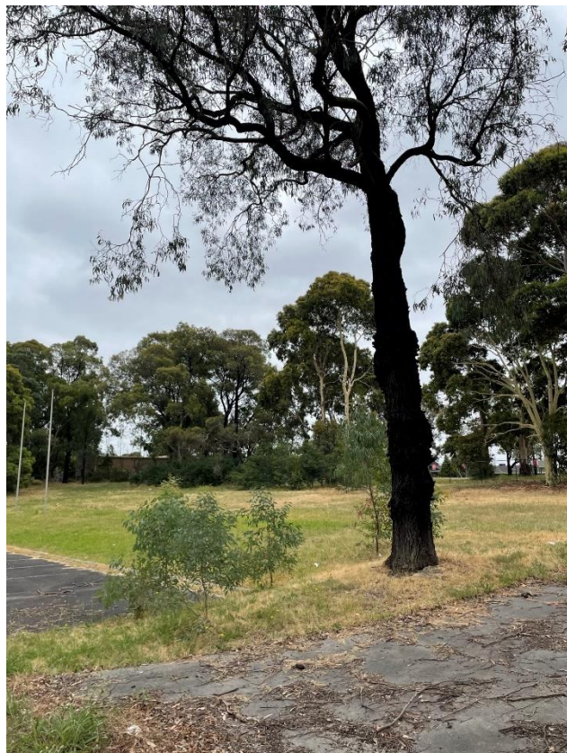
View of the northern lawn and Burwood Highway planting, January 2023.