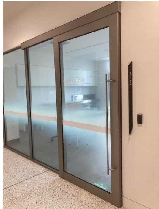
Pottery Studio Entrance