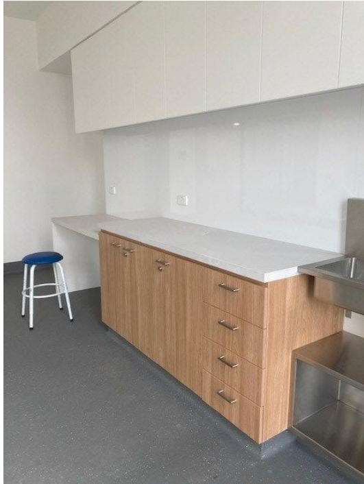
Pottery bench and cupboards