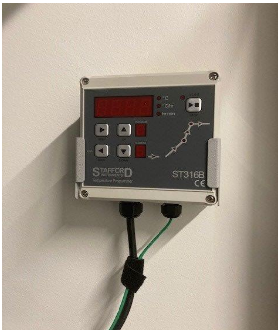
Pottery kiln controller