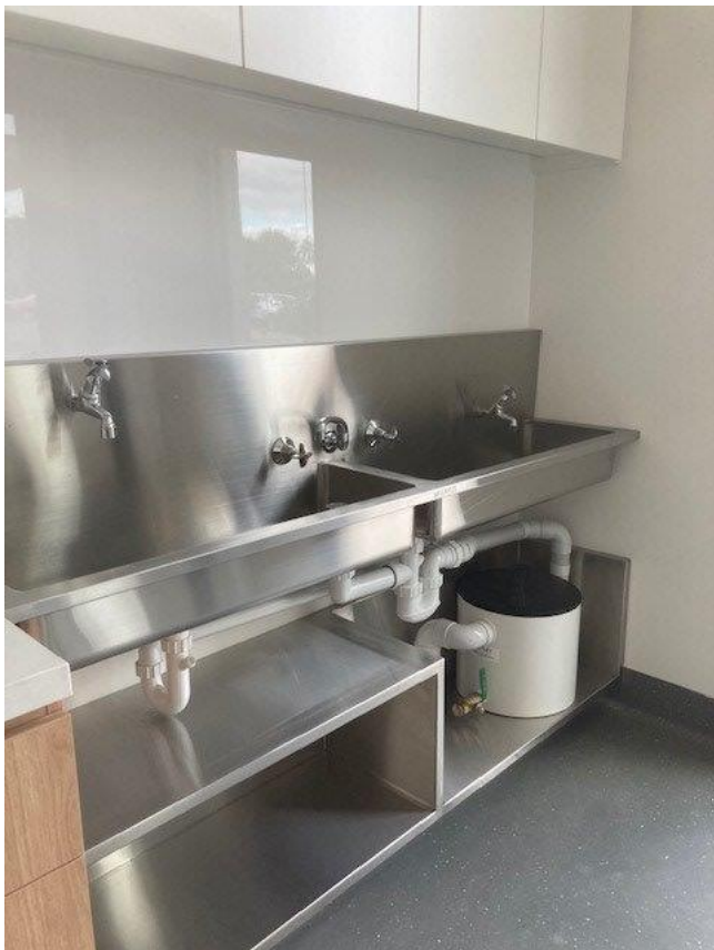
Pottery wash trough