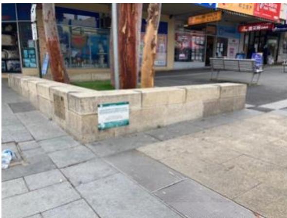
Wall 3 Outside Medical Centre