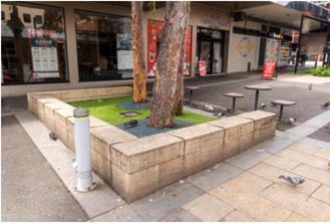
Wall 5 With chairs and tables