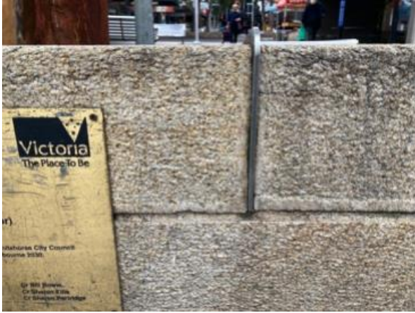
Wall 1 Facing Whitehorse Rd