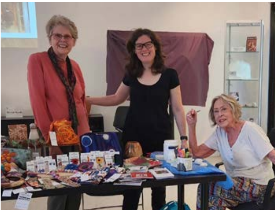
The Alcove Art Shop, Environmental and Sustainability Grant and Creativity Grant 2024.

SmartyGrants will send confirmation of receipt of submitted applications to the email address provided in the application.