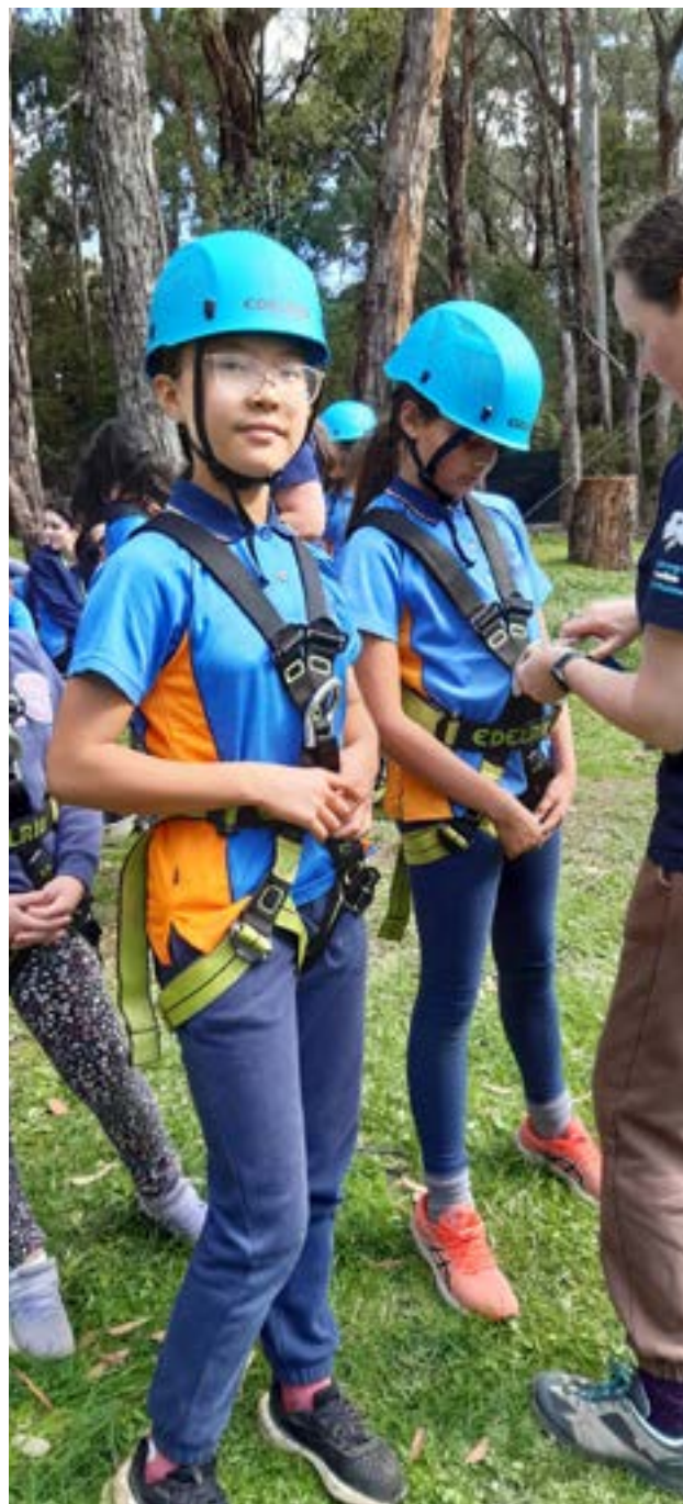
5th Vermont Girl Guides, Small Equipment Grant 2024.