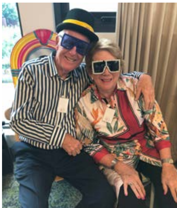
Umbrella Dementia Cafes, Major Grant 2024.