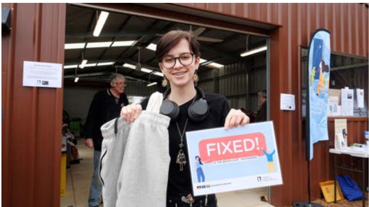
healthAbility Repair Café, Major Grant 2023.