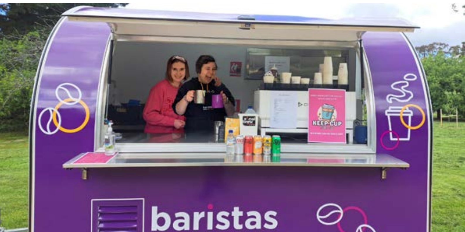
Alkira, Small Equipment Grant 2024

These are available on our Whitehorse Community Grants webpage at whitehorse.vic.gov.au/grants-community .