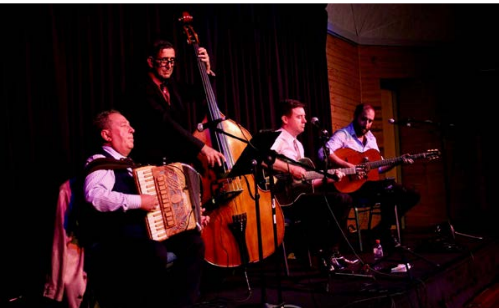
The Boite, Creativity Grant 2024