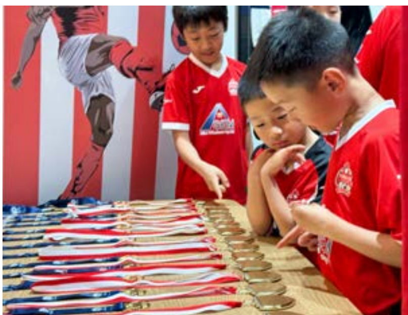
Burwood City Football Club, Small Equipment Grant 2024.

Acquitting a grant means accurately reporting on the funded activities and the expenditure of the funding. It is used by Council to ensure that the funding has been used for the purpose intended in the funding agreement; and to demonstrate the terms of the funding agreement have been met.