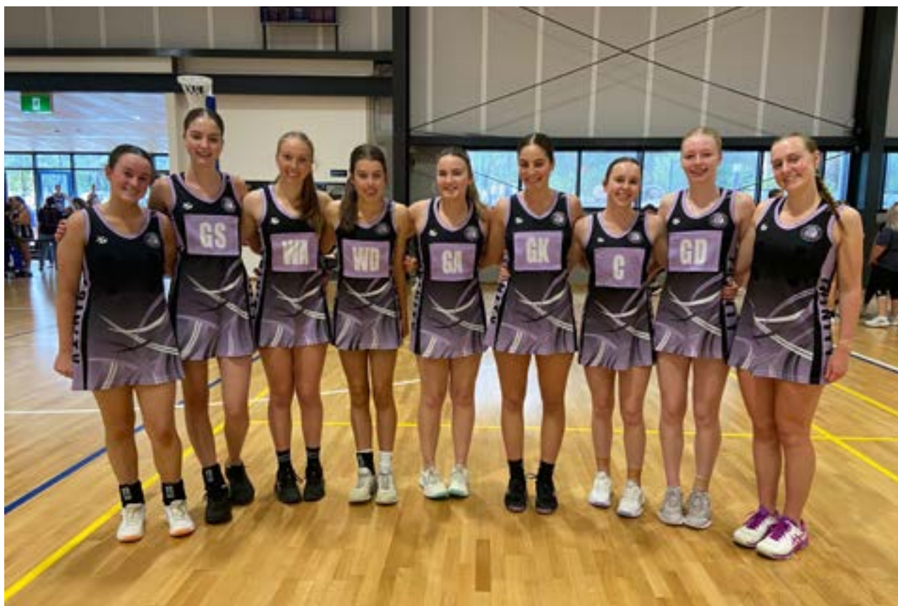
Trinity Netball Club, Small Equipment Grant 2024

Council reserves the right to seek reimbursement of grant funding from a funded organisation if the required evaluation or acquittal is not provided in a timely manner, or if Council is not satisfied that funds were used for the intended purpose.